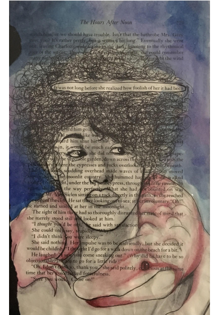
The Hours After Noon

...of us should have trouble. Isn't that the bathrobe Mrs. Gray wore? It's rather pretty, but it seems a bit long." Eventually she went out, leaving Charlotte alone in the study, listening to the rhythmic clap of the waves. There was a light breeze against her, she could remember many nights of the summer, but she had never felt so alone in the wind.